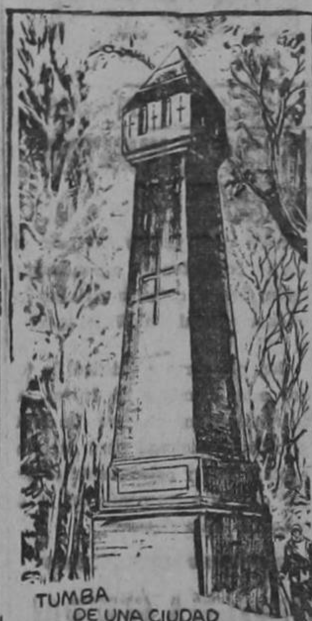
TUMBA DE UNA CIUDAD ESTE MONUMENTO MARCA EL SITIO QUE EN UN TIEMPO OCUPÓ LA MOTHE, UNA CIUDAD DE 32,000 HABITANTES EN EL VALLE DEL MOSA, EN FRANCIA, QUE FUÉ ARRASADA POR ORDEN DEL CARDENAL RICHELIEU EN 1645

Aprovecho esta oportunidad para renovar a Vuestra Excelencia los sentimientos de mi más alta