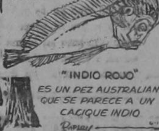
"INDIO ROJO" ES UN PEZ AUSTRALIANO QUE SE PARECE A UN CACIQUE INDIO