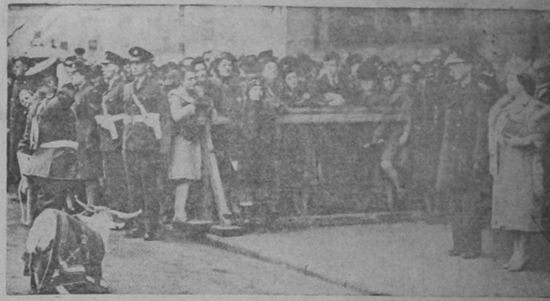
Sus Majestades los Reyes de Inglaterra pa san revista a un regimiento de infantería la mascota del ejército, una cabra, saluda de rodillas a las Altezas Reales.